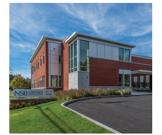
Northfield Savings Bank

Efficiency Vermont worked closely with the project team to set a path to achieve their net zero goal.