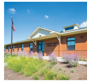
Yankee Farm Credit

Efficiency Vermont provided financial support for efficient equipment, enabling above-code energy performance.