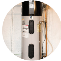
Heat pump water heaters