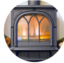
Cord wood and pellet stoves

Direct-vent or wall-vented space heaters do not qualify for financing through this program. Vermont Gas Systems customers are only eligible to finance ductless, cold-climate heat pumps through the Heat Saver Loan. Contact Vermont Gas or Efficiency Vermont to learn about other financing options.