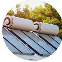
Solar hot water