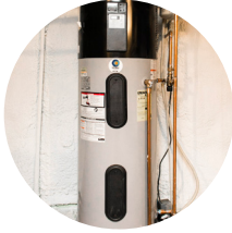
Heat pump water heaters