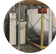
Central wood pellet furnaces and boilers