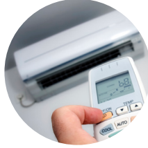
Cold-climate heat pumps